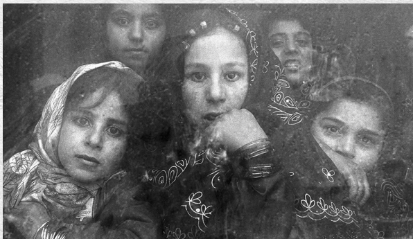
ORPHANAGE, KABUL, AFGHANISTAN